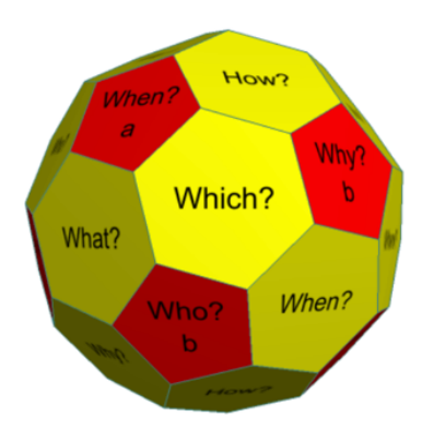
"Untitled" by Unknown Author is licensed under CC BY-NC

Hello English teachers! Are you ready to power up your English class? Here are some tips for practicing Wh-questions and answers in your English class.