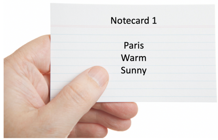
"Untitled" by Unknown Author is licensed under <u>CC BY-SA-NC</u>

For example, "Sasha, what do you have on your notecard?" And Sasha may answer, "I have 'Paris, warm and sunny.'"